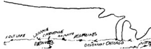
Kerouac's map of his first hitchhiking trip, July-October 1947 (click image to see the full map)