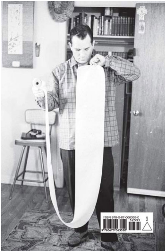
From the back cover of On the Road: The Original Scroll : Jack Kerouac displaying one of his later scroll manuscripts, most likely The Dharma Bums