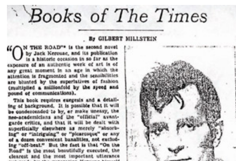
Original New York Times review of On the Road (click image to see the full review)