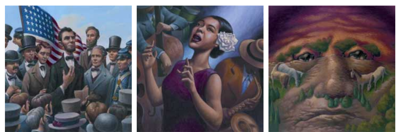
You Are Part of a Family

Click on the photos below to view the full spreads from the book.